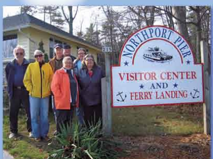
Northport Terminal and Visitor Center AMPLE, FREE, FERRY CUSTOMER PARKING

Check out our WebCam! Northport Pier and Island Ferry Docks