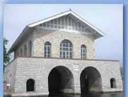
Thordarson Boathouse, Rock Island

Karfi runs daily (late May – mid-October)